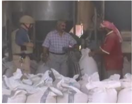
USDA photo of feed production for Iraqi poultry producer.

While visiting Iraqi animal industry facilities and meeting with key poultry, aquaculture and animal feed contacts remains a challenge, it will not prevent a determined ASA-IM and FAS effort to implement an expanded market development program that will help Iraqi's to improve their diets with American soy.