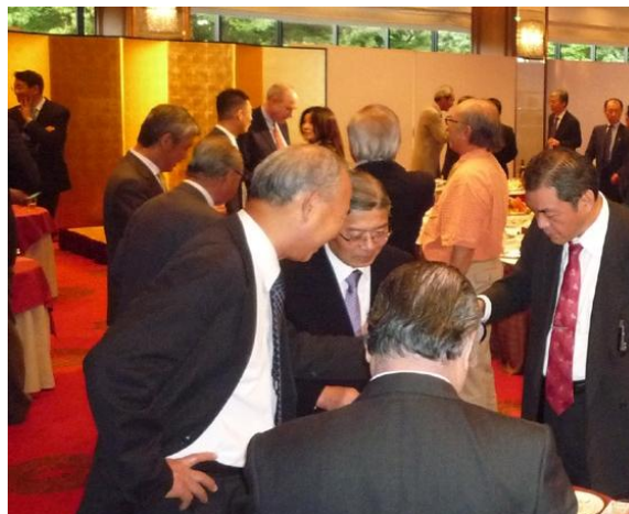
Japanese Natto industry officials discuss U.S. natto production at annual conference

ASA-IM Japan continues to support and reinforce U.S. farmers' commitment to the Japanese soyfood complex customers. Japan is the largest single market for non-GMO identity preserved U.S. food grade soybeans.